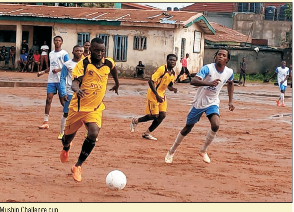
Mushin Challenge cup

CTL FC won 3 games from 4 games, they lost a match and won 3 matches.